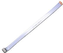
STVOFL12 24V LED Flexible Tape Light Joiner • Length: 12"