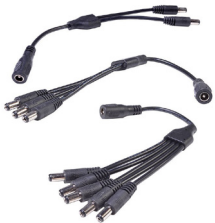
STVOFLYCON LED Flexible Tape Light Y-Connector DC Power Feed • Simply plug 2, 3, or 5 way Y Connector in the male end of your power supply to the female ends of the Y-Connector Power Feed.