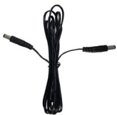
STVOFLCOND12 Male - Male DC Extension Cable • 2.1 mm Male-Male DC Extension Cable • Length: 8'